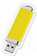
USB Flash Drives