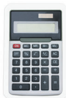
Associated Learning Materials

Education Tax Refund Claim everything you are entitled to