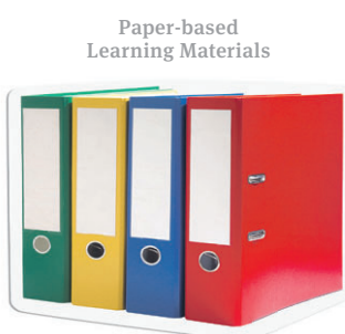
Paper-based Learning Materials